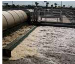
Figure 1. Foaming Before Dosing With Bio Genesis®

Bio Genesis® from Huma® Environmental is a formulation of nutrients, organic acids, natural biological stimulants, and energy systems that balance the natural microbial ecosystem to increase bio-oxidation capacity in activated sludge systems. Bio Genesis® reduces operating costs by lowering BOD/ COD and improving settleability while controlling filamentous bacteria and reducing FOG.