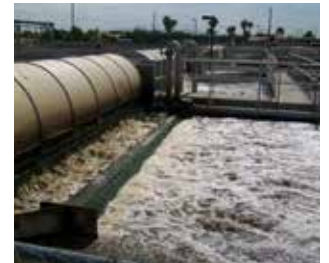
Figure 2. Foaming After Dosing With Bio Genesis®