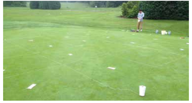
Figure 2. Study plots treated with PROMAX<sup>®</sup>, followed by ZAP<sup>®</sup>.

Figure 1. The effect of PROMAX® on stunt nematodes.