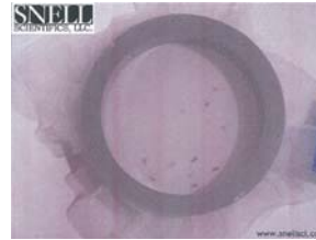
Potato Aphids in 1.75" CPVC Cartridge

Dead: Insects exhibit no movement even when stimulated